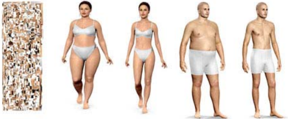
Figure 1: Examples of visual stimuli for males and females

This baseline "resting" period was a non-demanding task that was used to subtract out shared activation from the evaluation condition. Instructions that invite minimally demanding cognitive processing of the rest stimuli kept participants engaged in the task and prevented their minds from wandering and creating random, inconsistent results (Stark & Squire, 2001).